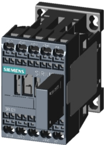
COUPLING CONTACTOR RELAY, 4NO, DC 24V, 0.85...1.85*US, W/ PLUGGED-ON VARISTOR, SZ S00, SPRING-LOADED TERMINAL