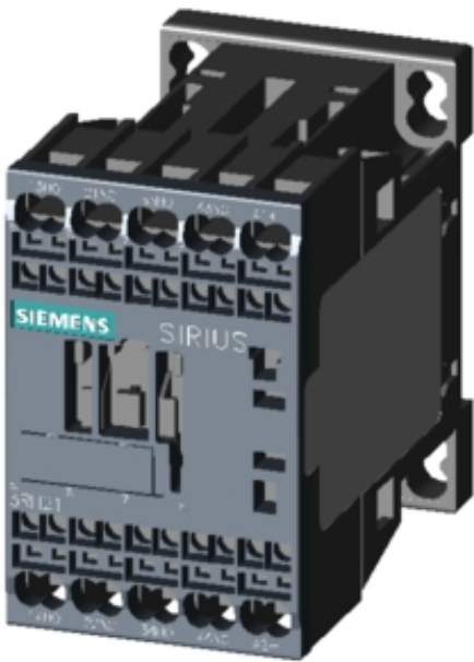
COUPLING CONTACTOR RELAY, 3NO+1NC, DC 24V, 0.85..1.85*US, SZ S00, SPRING-LOADED TERMINAL