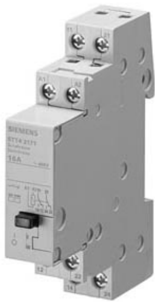
RELAY,N-TYPE W 2 CHANGE OV.CONT. CONTACT FOR AC 230, 400V 16A CONTROL DC 24V