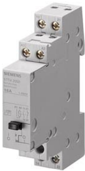
RELAY, N-TYPE WITH 1 NO AND 1NC CONTACT FOR AC 230V 16A CONTROL AC 8V