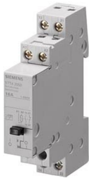
RELAY, N-TYPE WITH 1 NO AND 1NC CONTACT FOR AC 230V 16A CONTROL AC 230V