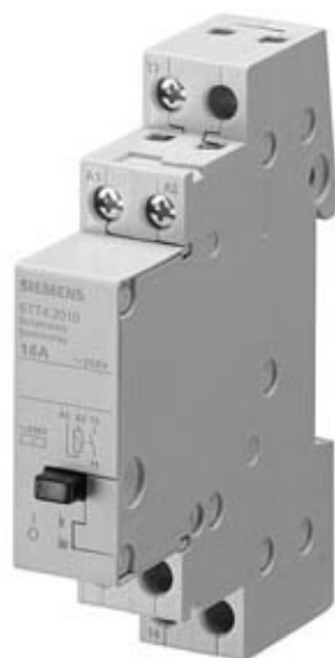
RELAY,N-TYPE W 1 CHANGE OV.CONT. CONTACT FOR AC 230V 16A CONTROL AC 230V