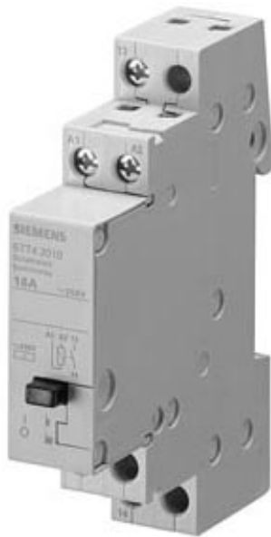
RELAY, N-TYPE WITH 2 NO CONTACT FOR AC 230V 16A CONTROL AC 8V