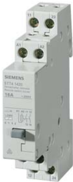
REMOTE SWITCH WITH 2 NO WITH JALOUSIE CONTROL CONTACT FOR AC 230, 400V 16A CONTROL AC 24V