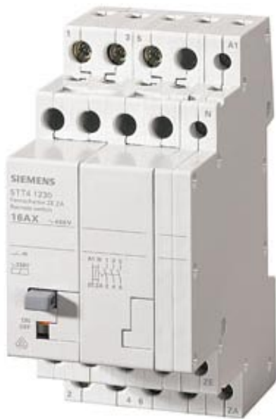
REMOTE SWITCH WITH 3 NO WITH CENTRAL ON-OFF-FUNCTION CONTACT FOR AC 230, 400V 16A CONTROL AC 230V