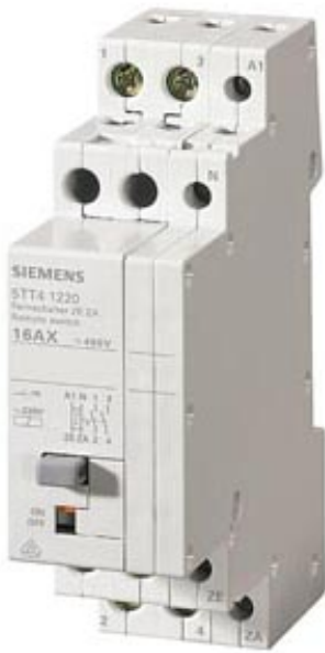
REMOTE SWITCH WITH 2 NO WITH CENTRAL ON-OFF-FUNCTION CONTACT FOR AC 230, 400V 16A CONTROL AC 230V