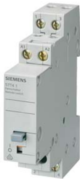
REMOTE SWITCH WITH 1 NO AND 1 NC CONTACT FOR AC 230, 400V 16A CONTROL AC 24V