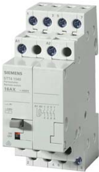
REMOTE SWITCH WITH 4 NO CONTACT FOR AC 230, 400V 16A CONTROL AC 24V