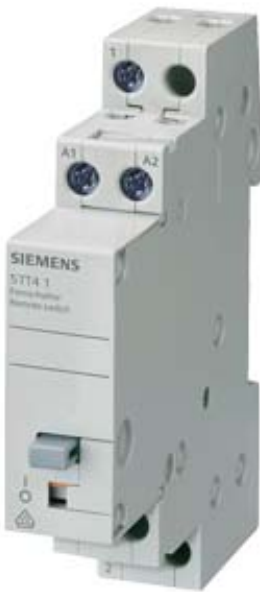
REMOTE SWITCH WITH 1 NO CONTACT FOR AC 230V 16A CONTROL AC 24V