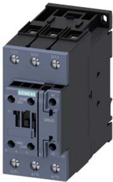
CONTACTOR,AC3:18.5KW/400V, 1NO+1NC,110VAC 50HZ/120V 60HZ, 3-POLE, SIZE S2, SCREW TERMINAL