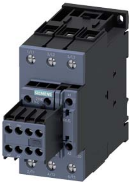
CONTACTOR,AC3:22KW/400V, 1NO+1NC,110VAC 50HZ/120V 60HZ, 3-POLE, SIZE S2, SCREW TERMINAL