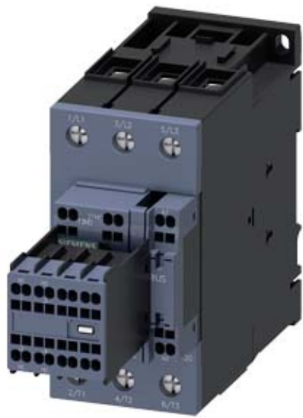
CONTACTOR,AC3:22KW/400V, 2NO+2NC, 110V AC 50HZ, 3-POLE, SIZE S2, SPRING-TYPE TERMINAL