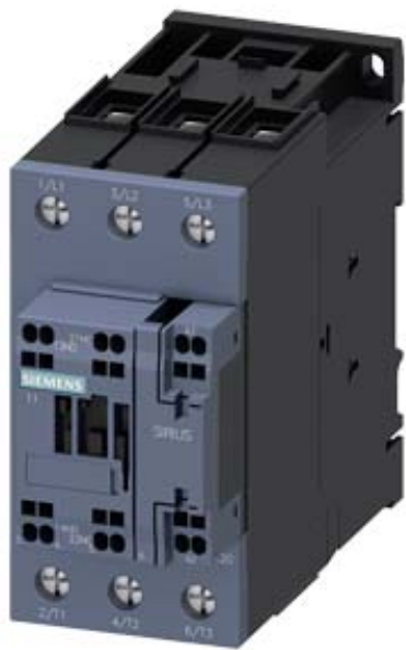
CONTACTOR,AC3:37KW/400V, 1NO+1NC, 220V AC 50/60HZ, 3-POLE, SIZE S2, SPRING-TYPE TERMINAL