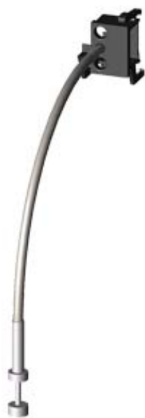
CABLE RELEASE WITH HOLDER FOR 3RU2 SIZE S00...S0