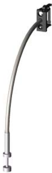
CABLE RELEASE WITH HOLDER FOR 3RU2 SIZE S00...S0