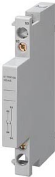
CONTROL SWITCH WITH 1 MAKE AND 1 BREAK CONTACT FOR AC 230V/400V FOR 5TT58 AND 5TT50