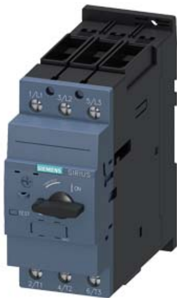
CIRCUIT BREAKER, SIZE S2, FOR MOTOR PROTECTION, CLASS 20, A-RELEASE 9.5...14 A, N-RELEASE 208A, SCREW TERMINAL, STANDARD BREAKING CAPACITY