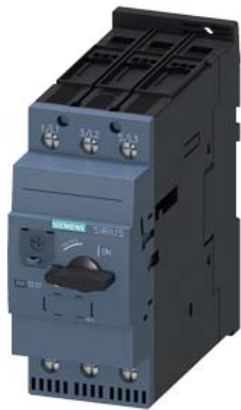
CIRCUIT BREAKER, SIZE S2, FOR MOTOR PROTECTION, CLASS 20, A-RELEASE 42...52A, N-RELEASE 741A, SCREW TERMINAL, STANDARD BREAKING CAPACITY