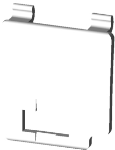
SCALE COVER, SEALABLE, FOR CIRCUIT-BREAKERS, SZ S00...S3.