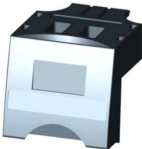
CABLE CONNECTOR SIZE S00 SPRING-L. CONNECTION MULTI-UNIT PACKAGE 10 UNITS