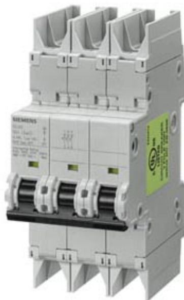
CIRCUIT BREAKER 10KA, 3POLE, C, 6A ACC. TO UL 489 - 480Y/277V