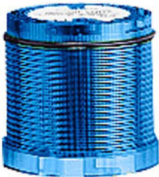
SIGNALLING COLUMN REPEATED-FLASH LIGHT ELEMENT BLUE, 230V AC/DC