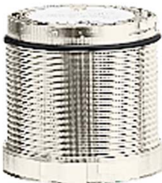
SIGNALLING COLUMN STEADY LIGHT TRANSP., 12...240V AC/DC