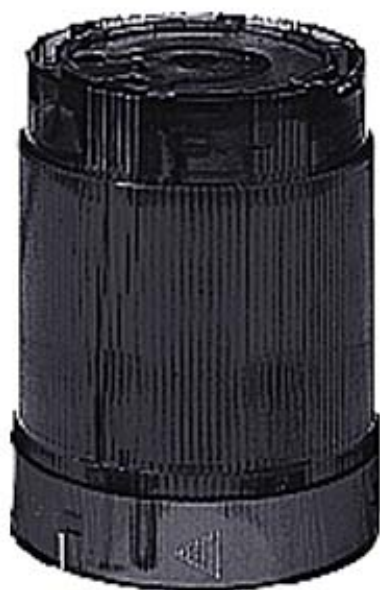
AS-INTERFACE ADAPTER ELEMENT WITH EXTERNAL AUXILIARY VOLTAGE FOR 4 SIGNALLING ELEMENTS BLACK DC 24 V