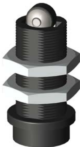
ACTUATOR HEAD FOR POSITION SWITCH 3SE51/52 ROLLER PLUNGER W. PLASTIC ROLLER 10MM W. CENTRAL FIXING