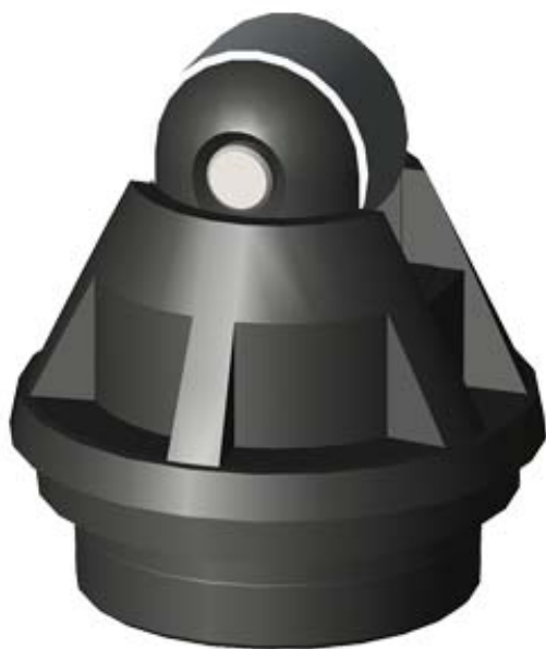
ACTUATOR HEAD FOR POSITION SWITCH 3SE51/52 ROLLER PLUNGER W. STAINLESS STEEL ROLLER 10MM