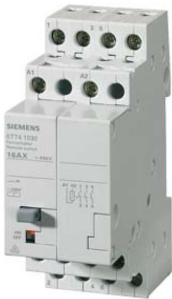
REMOTE SWITCH WITH 3 NO CONTACT FOR AC 230, 400V 16A CONTROL AC 230V