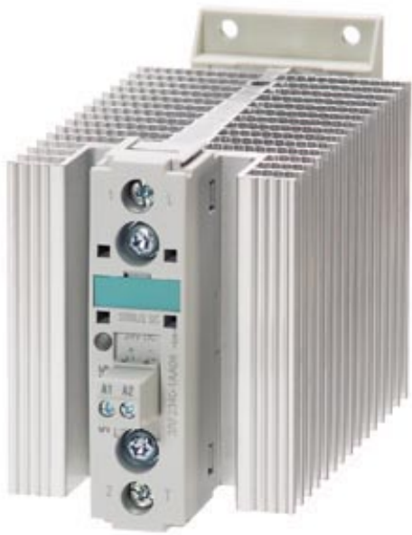
SEMI-COND. CONTACTOR 3RF2,1-PH. AC51 40A 40 DEGREES C 48-460V / 24V AC/DC SCREW TERMINAL