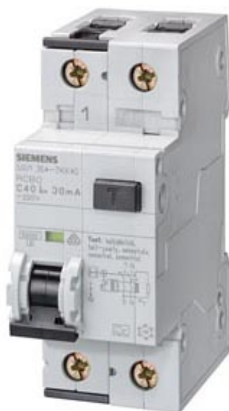
FI/LS-PROTECTOR TYPE A (PSE/SSF), D=70MM IFN 30MA,10KA, 1+N-POLEE B 6A