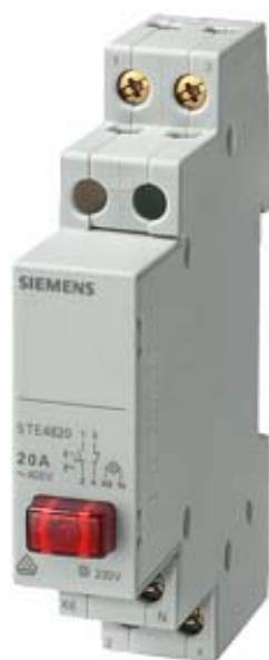
PUSHBUTTON, D=70MM 2NO 20A, 1BUTTON RED LAMP 230V