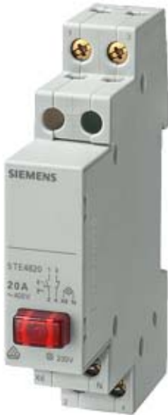
Similar to image

PUSHBUTTON, D=70MM 2NC 20A, 1BUTTON RED LAMP 230V