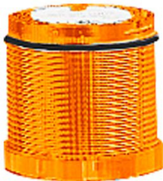
SIGNALLING COLUMN SINGLE-FLASH LIGHT ELEMENT YELLOW, 24V DC