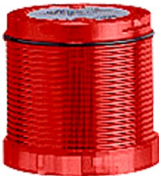
SIGNALLING COLUMN SINGLE-FLASH LIGHT ELEMENT RED, 230V AC