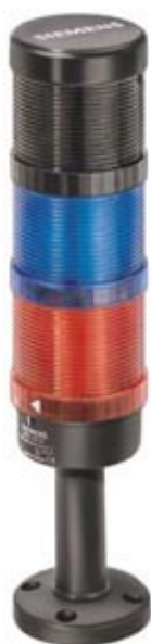
ADAPTER FOR BASE, CABLE OUTLET LATERALLY