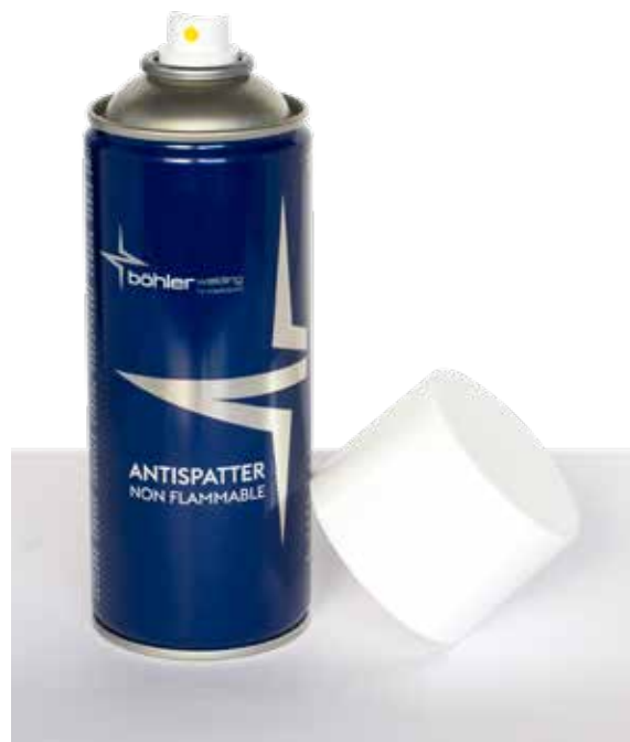
BÖHLER Anti Spatter Spray 12 x 400 ml cans in 1 carton