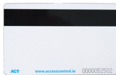
ACTProx DUO-B Prox & mag stripe Suitable for printing