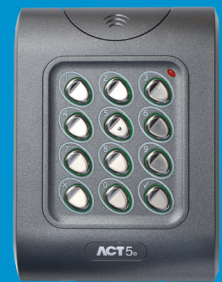
ACT 5e Digital Keypad