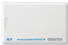
ACTProx HS-B Half shell proximity card Not suitable for printing