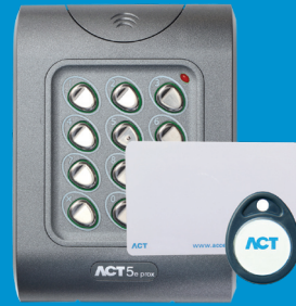
ACT 5e prox Digital Keypad & Proximity