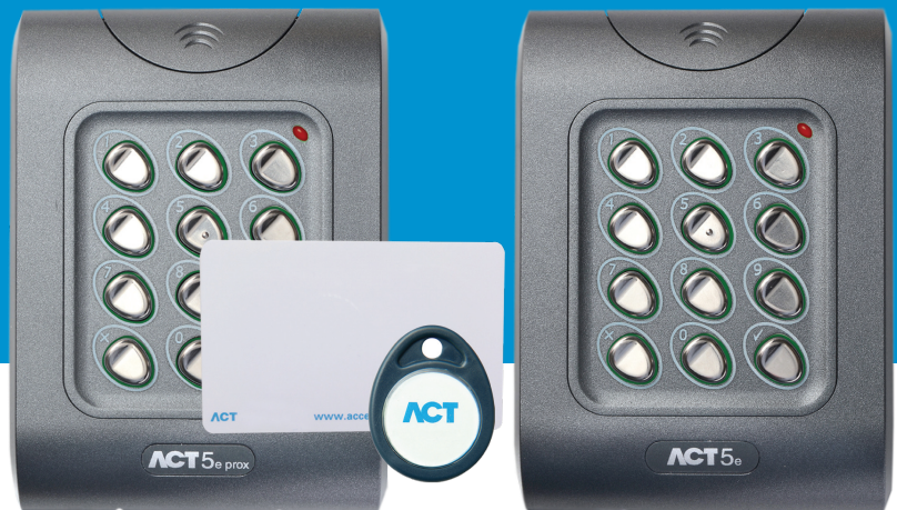
ACT 5e prox Digital Keypad & Proximity