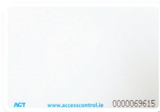
ACTProx ISO-B Proximity card Suitable for printing