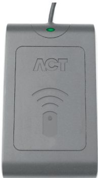
Product Code ACTpro USB Reader USB MIFARE Reader