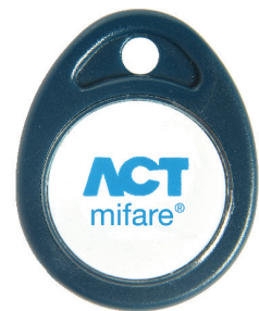
Product Code ACTpro MF Fob MIFARE FOB

All ACT products can be purchased through a network of distributors which can be found listed on the ACT.eu homepage. ACTpro readers and controllers are covered by a 5 year warranty.