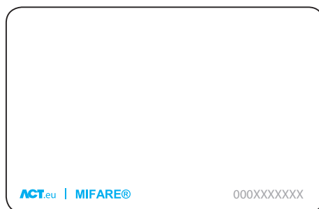
Product Code ACTpro MF Card MIFARE CARD