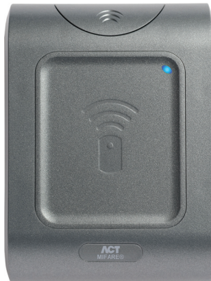
Product Code ACTpro MF 1040e Surface/Flush Mount Proximity Reader