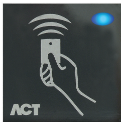
Product Code ACTpro MF 1030PM Panel Mount Proximity Reader