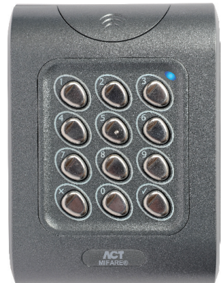
Product Code ACTpro MF 1050e Surface/Flush Mount PIN & Proximity Reader