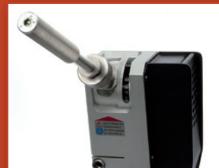
Adjustable grinding angle from 15-180° (included angle).

Industrivej 3 · DK-9690 Fjerritslev · Danmark Tlf. +45 96 50 62 33 · Fax +45 96 50 62 32 info@inelco-grinders.com · www.inelco-grinders.com