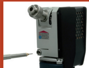
Precise adjustment of the stick-out.