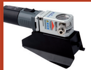
Stand to fix the NEUTRIX to a bench.