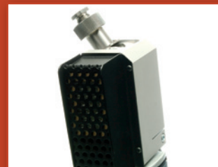
Integrated exhausting with a replaceable dust filter.