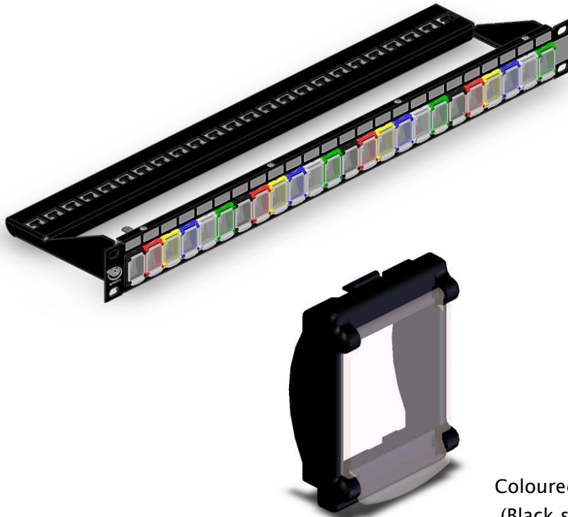
Coloured Icon with dust cover (Black supplied as standard)