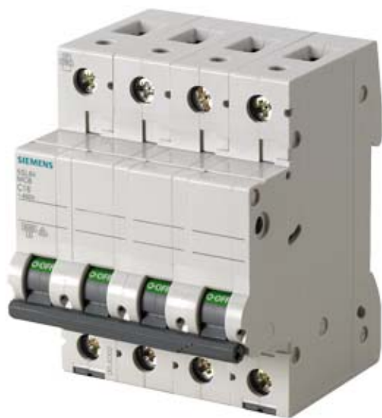
CIRCUIT BREAKER 400V 6KA, 3+N-POLE, B, 13A