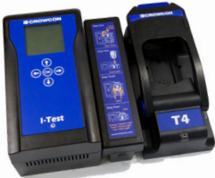
I-Test Easy automated bump testing and calibration solution