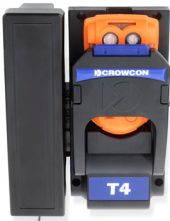
Vehicle charger Effective charging and storage whilst travelling