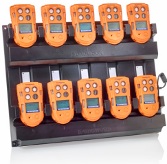
10 way charger For charging and storing your T4 fleet