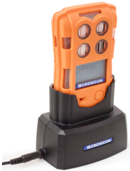
Cradle charger Docking station for easy charging

IN: Tel: +91 22 6708 0400 Fax: +91 22 6708 0405 Email: salesindia@crowcon.com