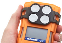
External filter plate Clip-on filter for dusty environments