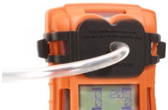
Bump/calibration plate To apply test gas to T4