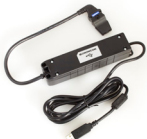
USB communications lead