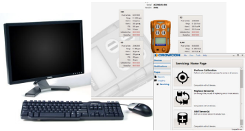
NEW Portables Pro 2.0 Software For easy configuration and servicing