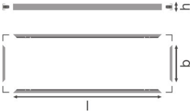
PANEL LED 1200 Surface Mount Kit Value

For more detailed application information and graphics please see product datasheet.