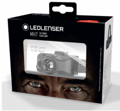
Exemplary Packaging Illustration