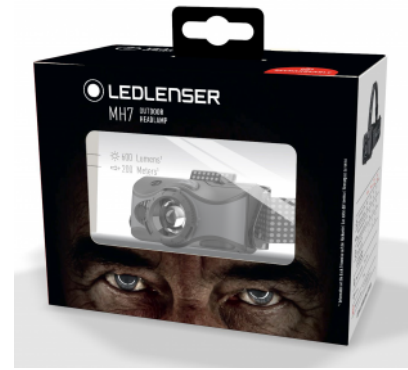
Exemplary Packaging Illustration