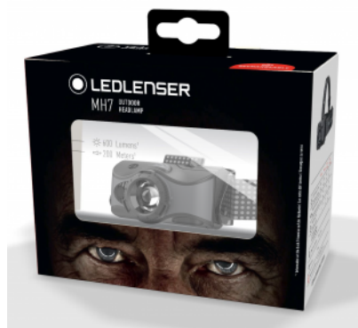
Exemplary Packaging Illustration