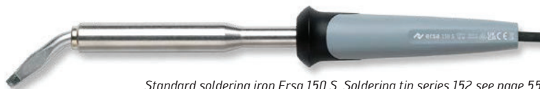
Standard soldering iron Ersa 150 S. Soldering tip series 152 see page 55.