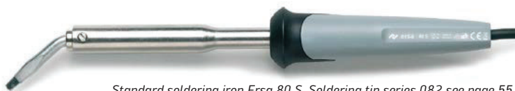
Standard soldering iron Ersa 80 S. Soldering tip series 082 see page 55.