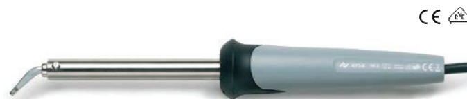
Standard soldering iron Ersa 50 S. Soldering tip series 052 see page 55.

Other areas of application include soldering thin sheet metal and lead glazing (Ersa 150 S).